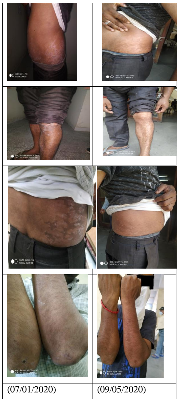
Fig. 2: Before and after treatment of Case